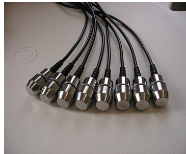
special small transducers