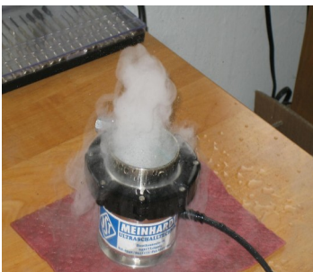
aerosol generation / nanotubes