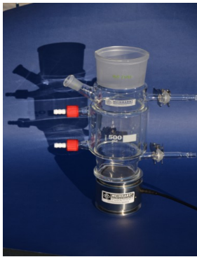
new 850 ml - 500-1500 ml cooling jacket